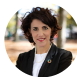
Antonella Santuccione Chada Women's Brain Foundation - Zurich, Switzerland