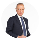
Alberto Beretta Chair