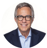
Camillo Ricordi Diabetes Research Institute - Miami, USA